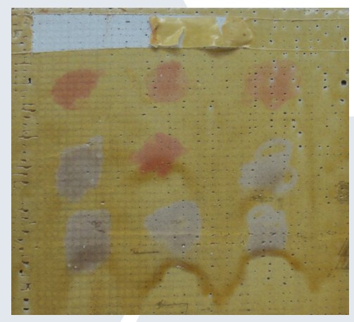
Sample with sequestered hazardous contaminants – Pink regions indicate Mercury(II) while blue/gray regions indicate Copper(II).