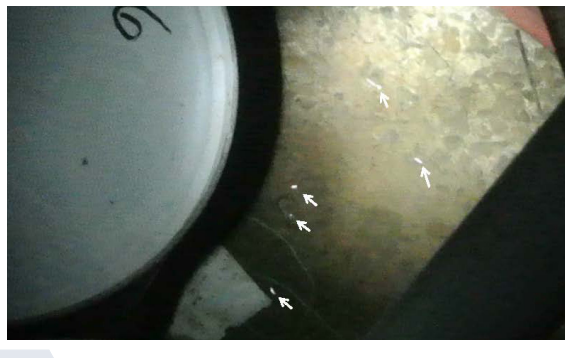
Mercury beads in a Y-12 building basement.

Trap & See™-Hg clearly indicates the presence of mercury in different concentrations even in the presence of other interfering metal ions (left). It is compatible with and strippable from both PVC pipe (above) and brick (left).